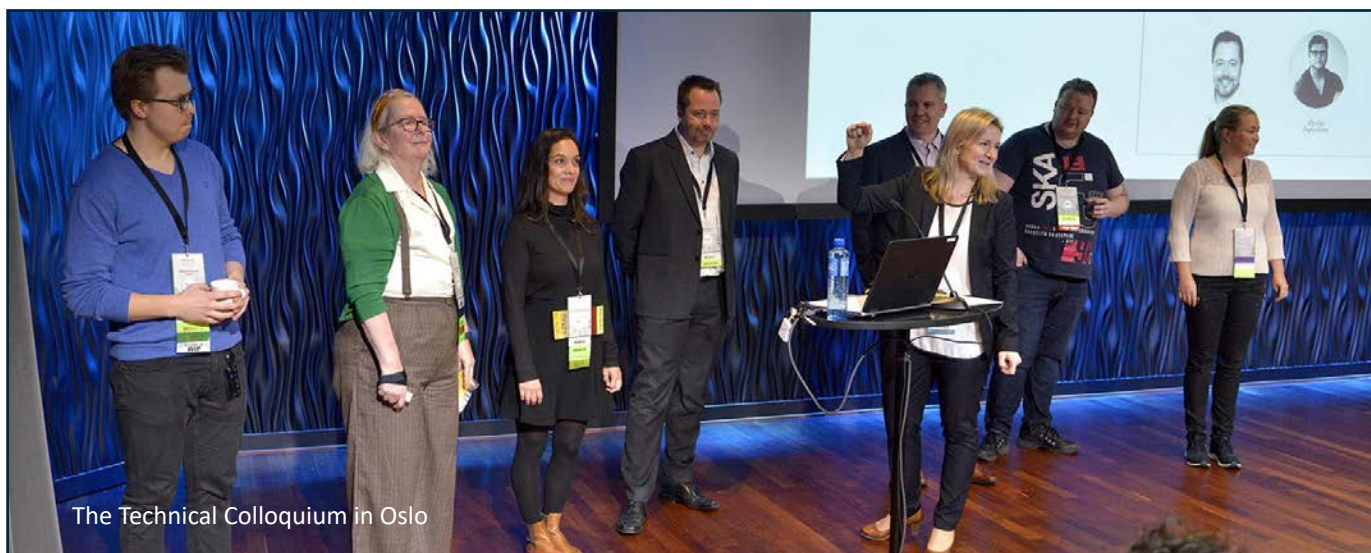
The Technical Colloquium in Oslo

Members and non-members should keep our 2022 events calendar bookmarked to see what's coming up this year!